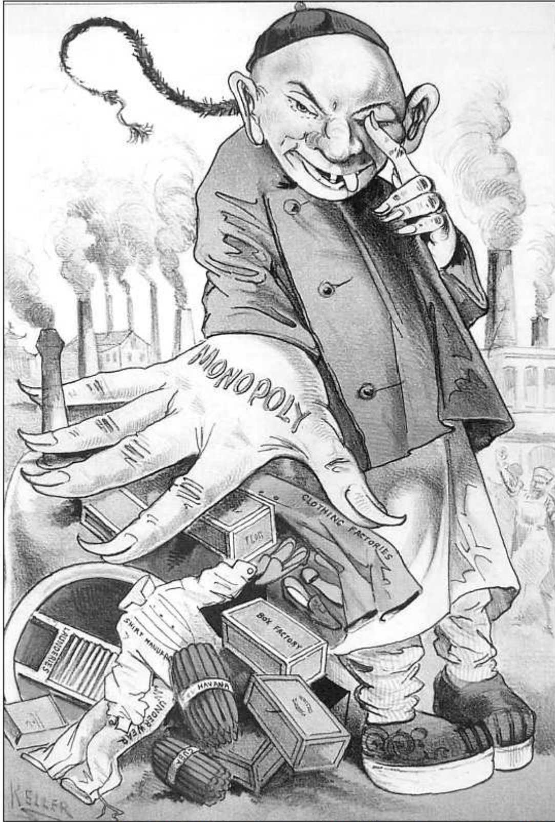
The Coming Man. George Keller / Wasp, San Francisco, 1881

http://www.nieonline.com/cftc/pdfs/xenophobia.pdf